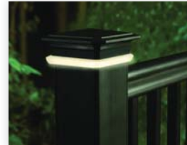
Post Cap Module

Generates a subtle, inviting glow around any TimberTech RadianceRail or RadianceRail Express Post Caps. Post Caps sold separately.